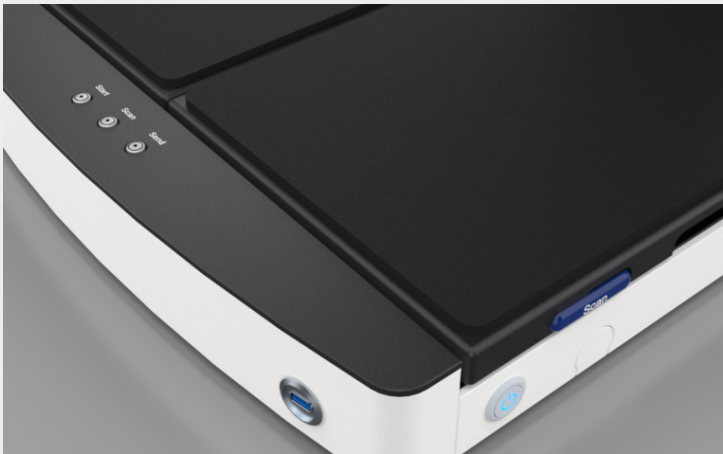
Store images directly to any USB devices via the USB 3.0 port